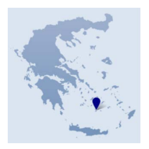
Figure 1 JTR Airport

Santorini International Airport is located on the East side of the Santorini island, close to Kamari village. It is 6 km from the island capital, Thira, and 2.5 km East of Mesaria.