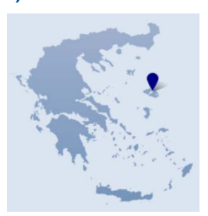
Figure 5 MJT Airport

Mitilini International Airport "Odysseas Elytis" is located on the South-East side of the Island of Lesbos, the third largest island in Greece situated in the Eastern Aegean Sea.