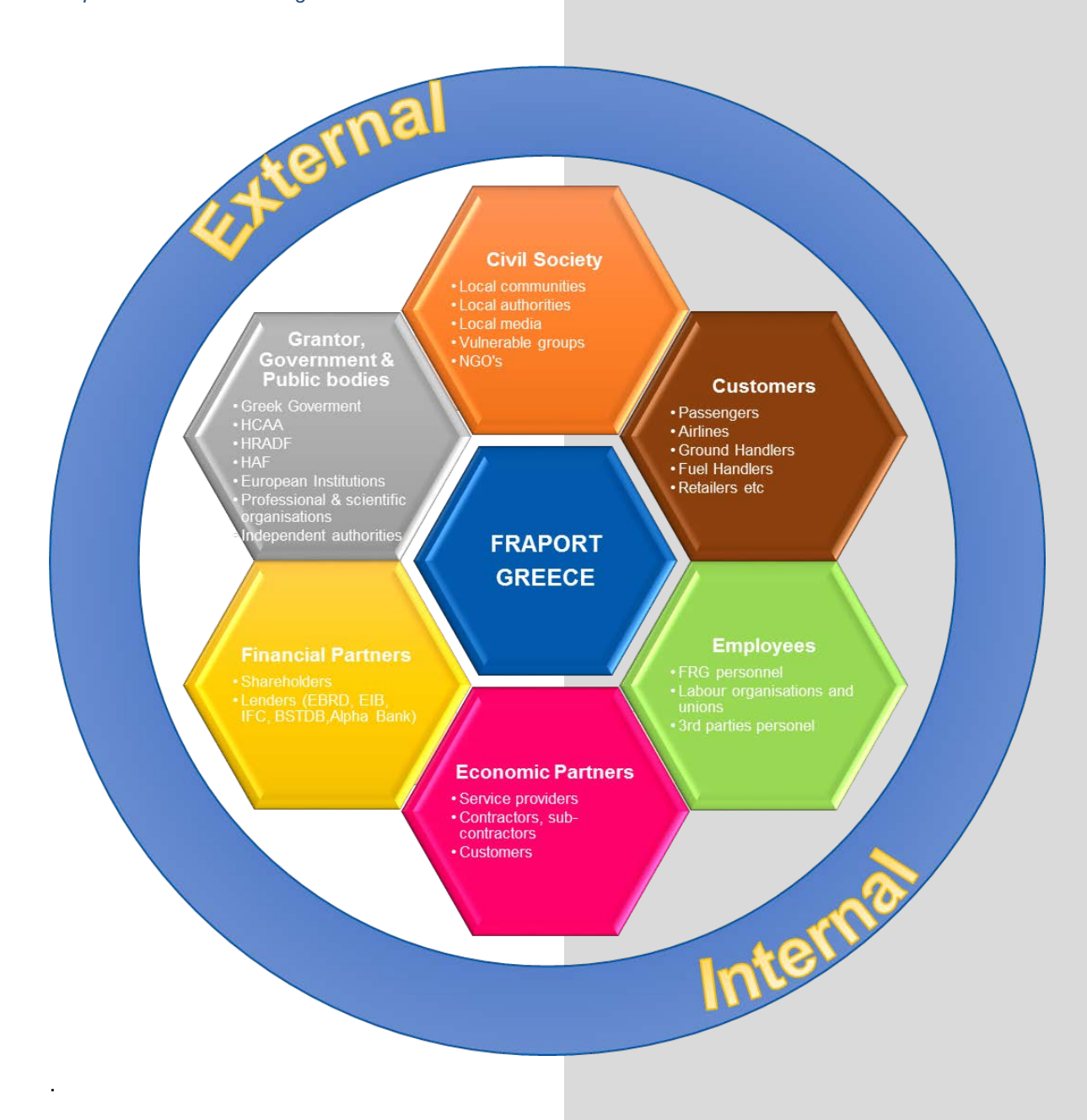
Graphic 1 Stakeholder categories