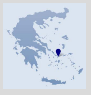
Figure 4 JMK Airport

Mykonos International Airport is located on Mykonos Island, part of the Cyclades islands, approx. 4 km south east of the town of Mykonos (Chora), a journey of about 10 minutes. Mykonos is one of the most touristic island of Greece.