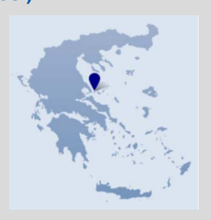
Figure 3 JSI Airport

Skiathos International Airport "Alexandros Papadiamantis" is located on the East side of the Island of Skiathos in the Western Aegean Sea. The airport is around 2 km from the capital of the island, the town of Skiathos.