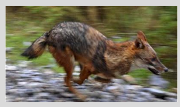
Figure 15 Golden Jackal

Specifically, four (4) InfraRed camera traps were placed in two (2) sites within the airport area. Jackals were spotted during night time and their point of entrance was located. Archipelagos will continue to observe the area in order to gather more data and will then proceed to propose measures and action for its relocation.