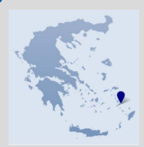
Figure 7 KGS Airport

Kos International Airport "Ippokratis" is located near the village of Antimacheia in the Irakleides region of Kos Island, approx. 27km south-west of Kos Town.