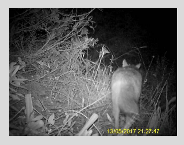
Figure 16 Golden Jackal within SMI airport boundary (May 2017, Archipelagos and FG).