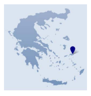
Figure 2 SMI Airport

Samos International Airport "Aristarchos of Samos" is located on the South-East side of the Island of Samos in the Eastern Aegean Sea. The airport is around 3 km from the town of Pythagoreio and 14 km from the capital of the island, the town of Samos, formerly known as Vathi.